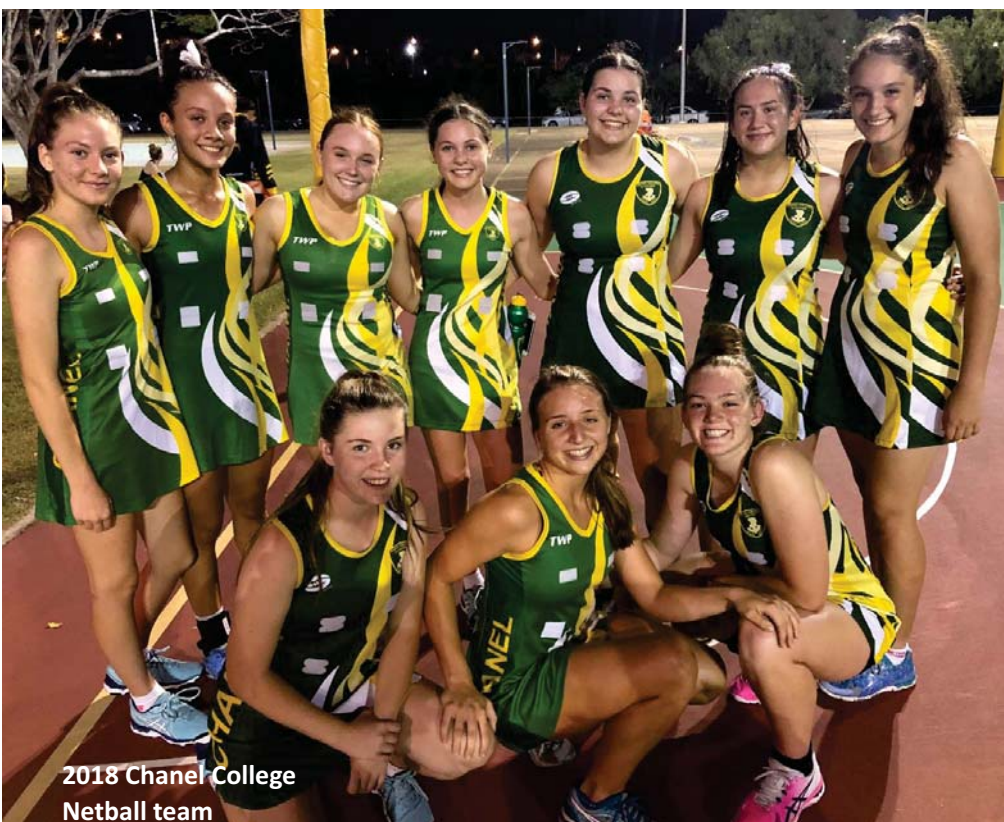
2018 Chanel College Netball team

Thank you to our team sponsors who have come on-board this year to provide financial support for the team. We would like to thank Optima Dental and Santos GLNG for their support of the 2018 QISSN Netball team. Gold Star Embroidery have been generous in supporting the team through the supply of training gear for the team, thank you Gold Star Embroidery. Good luck to the girls for the Sullivan's Carnival on the weekend and for the rest of the Gladstone Netball Tuesday night season.